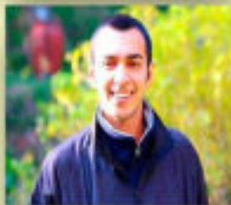
Karan Godara 2774/(NET-JAN 2017) The evolution of the international criminal justice system with special emphasis on its efficacy in dealing with international crimes (UGC)