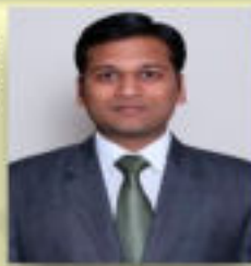
Rinku Jain Metropolitan Magistrate, DJS Batch 2009-12