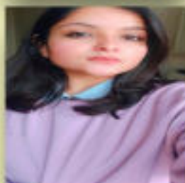
Rozy JRF Revisiting the legal provisions relating to enforcement of contracts in India: Recent trends and issues involved UGC