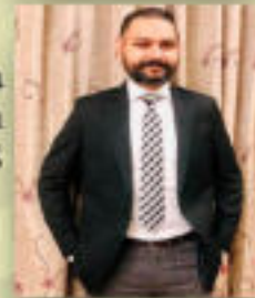
Jinderpal Singh Civil Judge cum Judicial Magistrate, Punjab Batch 2001-04