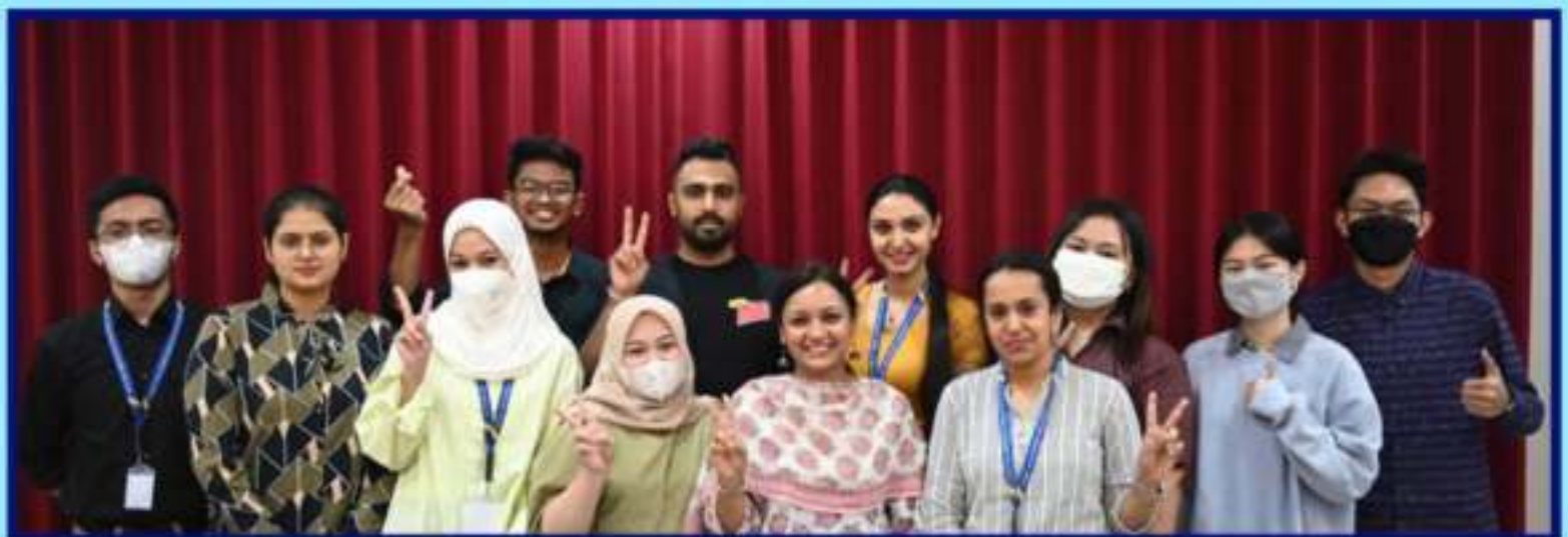
Students of Department of Laws for a Student Exchange Programme at Universitas Airlangga, Surabaya Indonesia.

Winner of 'Inter College Environment Quiz' held during Environment Fest